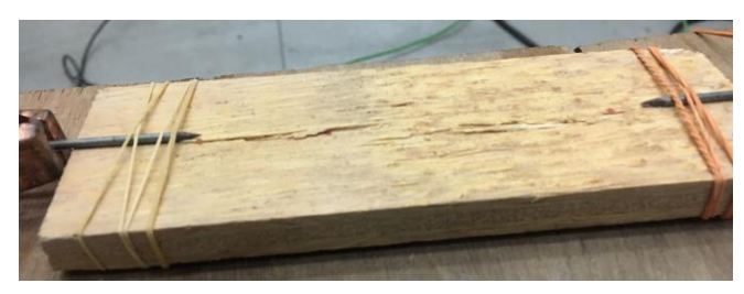
Figure 3: Bentonite contaminated sample with parallel fiber orientation before and after 25 voltage impulses (12 breakdowns)

Hence, it can be stated with certainty that if an arc occurs parallel to the fibers the damage will be severe, and the degradation of the material will be apparent to the naked eye. Further, a wetted surface has a much high chance of an arc occurring as the breakdown voltages are significantly lower. However, any structural damage was not visible to the naked eye, though a reasonable conclusion can be drawn towards the degradation of the sample as a pungent order was given off after each impulse.