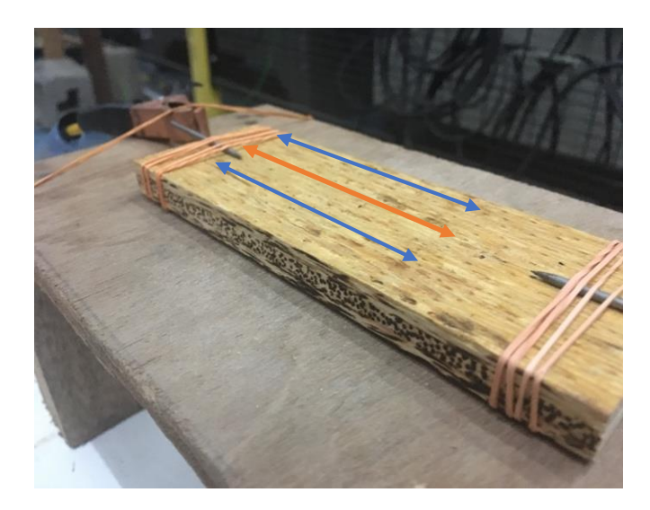
Figure 2: Dry sample with no contamination setup for parallel fiber orientation

The area of the damage is clearly visible along the channel of the current at breakdown between the rods. V_{50\%} was significantly lower in the wet sample with fibre orientation parallel to the gap length. However, in this case, the standard deviation was almost comparable with the V_{50\%} value.