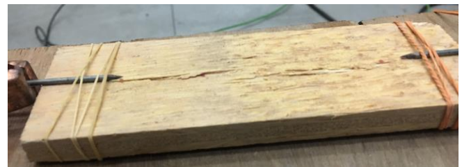
Figure 3: Bentonite contaminated sample with parallel fiber orientation before and after 25 voltage impulses (12 breakdowns)

Hence, it can be stated with certainty that if an arc occurs parallel to the fibers the damage will be severe, and the degradation of the material will be apparent to the naked eye. Further, a wetted surface has a much high chance of an arc occurring as the breakdown voltages are significantly lower. However, any structural damage was not visible to the naked eye, though a reasonable conclusion can be drawn towards the degradation of the sample as a pungent order was given off after each impulse.