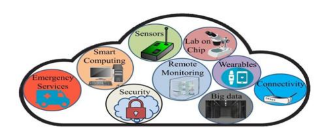
Figure 3: IOT in smart healthcare

By using IOT anyone, anywhere connected to Healthcare ubiquitous services, including small or large healthcare facilities, buildings and personal space. On online consultancy or alert generation, ambulatory services, emergency situations and planned schedules, it covers the clinical management of patients. The IOT platform provides a large variety of data [26].