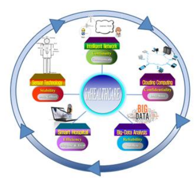
Figure 5: IOT based on HEALTHCARE informatics system architecture