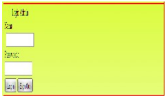
Figure 4: Admin page