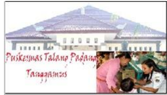
Figure3: Main Page

The results of the analysis conducted by the researcher above can provide convenience to the Community Health Center staff in publishing Health Center information, and Outpatient information at Health Center, without limited working hours. So the community can access information anytime, anywhere, without limited work hours. So the community can access the information about Talangpadang Health Center anywhere and anytime.