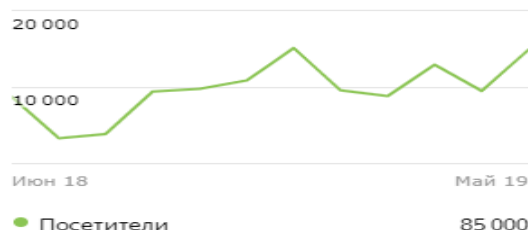
Figure 4 - Analysis of visitors of the information and educational environment for 2018

For example, with the help of Yandex.Metrica, we can see that over the past year more than 85 thousand visitors have visited the resources of our electronic information and educational environment (Figure 4). Analyzing the sources of traffic, we can conclude that the main source of traffic in our environment is internal referrals (33.9%), in second place are referrals from search engines (23%), then follow links on sites (21, 4%), direct visits (15.6%) and transitions from social networks (6.23%).