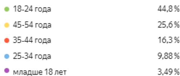
Figure 5 - Analysis of the age of visitors to the information environment for 2018

Very useful is the analysis of the types of devices used. In our environment, more than 75% of users use personal computers as the main tool for accessing informational and educational environment materials, 24% of users use smartphones, less than 1% tablets, several people have used the TV over the last year to access electronic course materials. Analyzing this statistical information, it is worth noting that the share of smartphones and tablets as devices used in the information-educational environment is constantly growing. Unfortunately, the pace of this growth leaves much to be desired. Taking into account the fact that the authors of the Moodle platform have developed specialized clients for mobile devices for the main operating systems, taking into account the adapted design of the platform and statistics on the use of mobile devices of other training services, we can conclude that the low increase in users of mobile devices is primarily queue, with low adaptation of e-course content teachers to use on mobile devices.