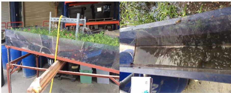
Fig. 2. Simulated rainfall (a) and measurement of flow rate (b) during the experiment.

An artificial rainfall simulator was installed at 0.5 m height above the green roof test bed. The simulated rainfall was set to run for 5 minutes duration and time was recorded after the rainfall initiated. A total of 400 liter of simulated rainfall volume was poured onto the green roof test bed during the experiment. Once the first runoff is observed, time was recorded for each experiment. The stormwater runoff that discharged from drainage layer within the green roof test beds was drained out by using a PVC pipe. A runoff harvesting tank was placed under the green roof test beds and connected to the PVC pipe in order to collect the runoff from green roofs. The water volume in the runoff harvesting tank was measured and time of each measurement was collected simultaneously during the simulated rainfall period. The measured runoff volume and time were converted to runoff flow rate in order to plot the hydrograph for each experiment.