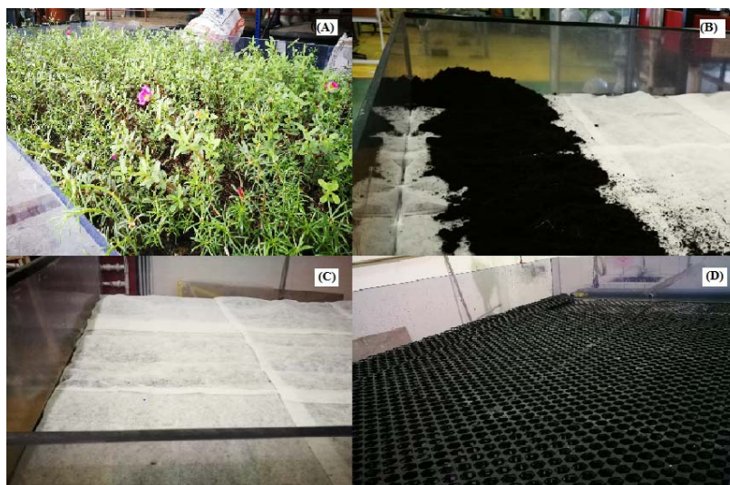
Fig. 1. Experimental green roof test beds that established in this study.

This experiment was conducted at the civil engineering laboratory in Universiti Tenaga Nasional (UNITEN). The dimension of green roof test bed is 2.0 m length x 1 m width x 0.2 m height, and installed at a height of 1m above the ground level. Figure 1 shows the experimental green roof test beds that established in this study.