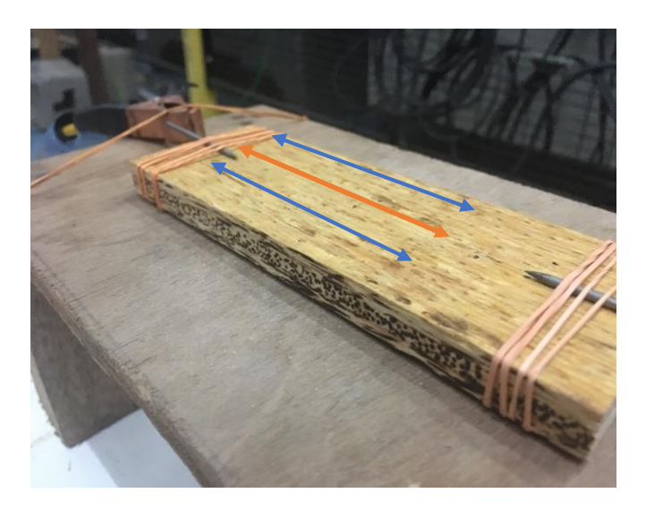
Figure 2: Dry sample with no contamination setup for parallel fiber orientation

The area of the damage is clearly visible along the channel of the current at breakdown between the rods. V_{50\%} was significantly lower in the wet sample with fibre orientation parallel to the gap length. However, in this case, the standard deviation was almost comparable with the V_{50\%} value.