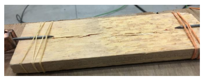
Figure 3: Bentonite contaminated sample with parallel fiber orientation before and after 25 voltage impulses (12 breakdowns)

Hence, it can be stated with certainty that if an arc occurs parallel to the fibers the damage will be severe, and the degradation of the material will be apparent to the naked eye. Further, a wetted surface has a much high chance of an arc occurring as the breakdown voltages are significantly lower. However, any structural damage was not visible to the naked eye, though a reasonable conclusion can be drawn towards the degradation of the sample as a pungent order was given off after each impulse.