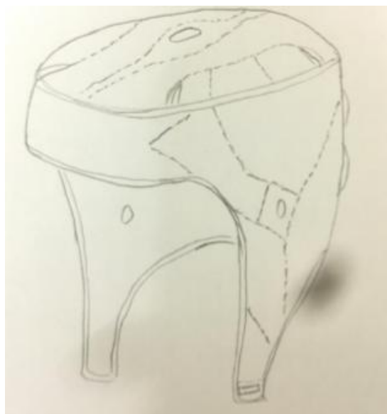
Fig. 2. Headgear isometric view. afford to hire the third party to maintain their grease trap.