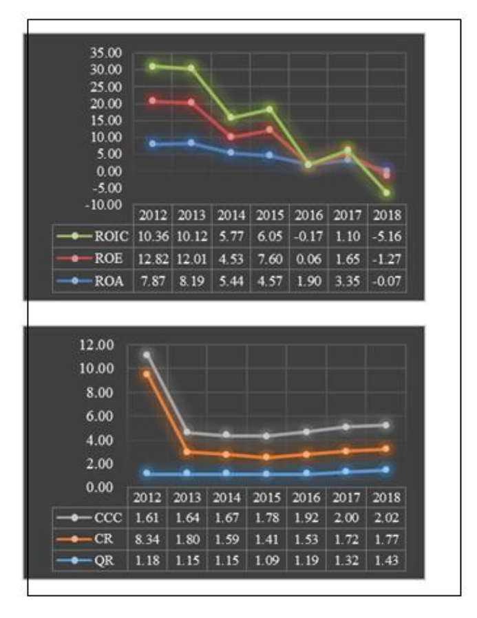
Fig. 2 Profitability and Liquidity of Oil and Gas Companies in Malaysia

Figure 2 shows the profitability and liquidity of oil and gas companies in Malaysia. As we can see, the profitability of the companies dropped as oil prices dropped sharply since June 2014. However, liquidity of the companies shows consistent after the crisis in oil prices. It can conclude that, even though the company's performance was decreasing every year, the companies cannot liquidate their asset successfully.