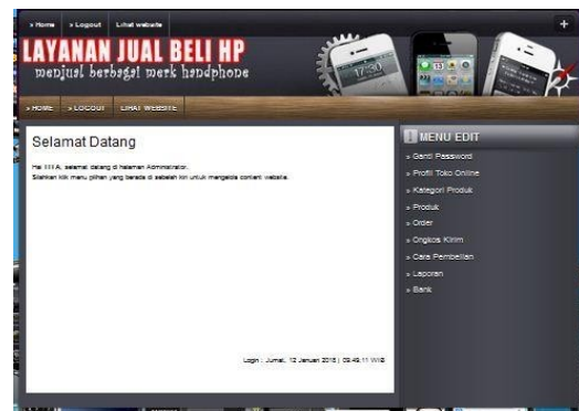
Figure 2. Admin Page Display

The administrator page is shown in figure 2.