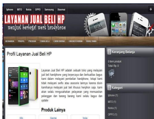
Figure 4. Profile page display