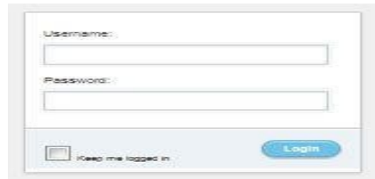
Figure 1. Login page